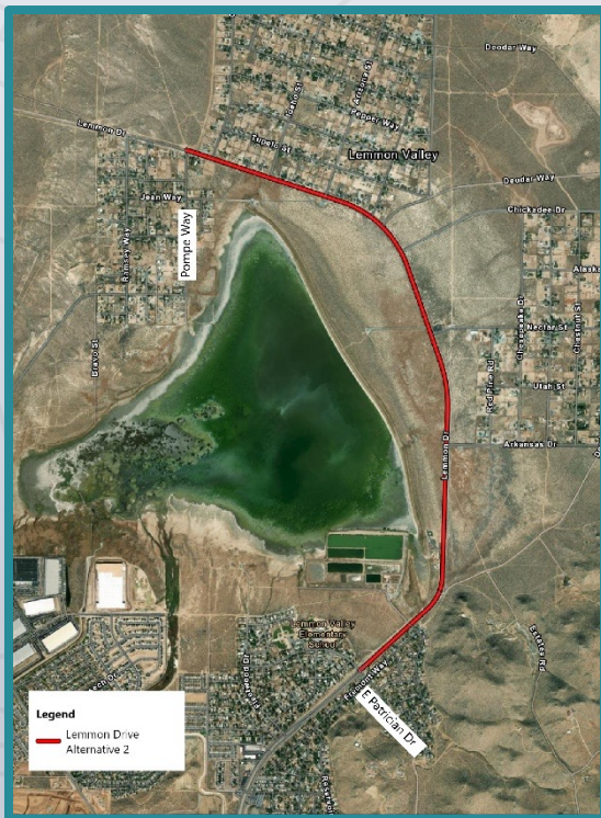
Alternative 2 Elevate Existing Lemmon Drive

Three alternatives considered in the Level 2 screening were presented to RTC Board in August 2020.