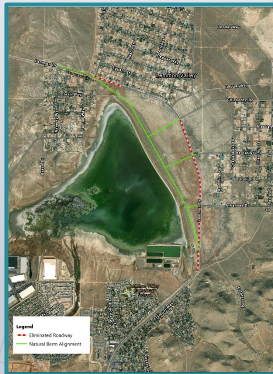
Alternative 6 Natural Berm Alignment